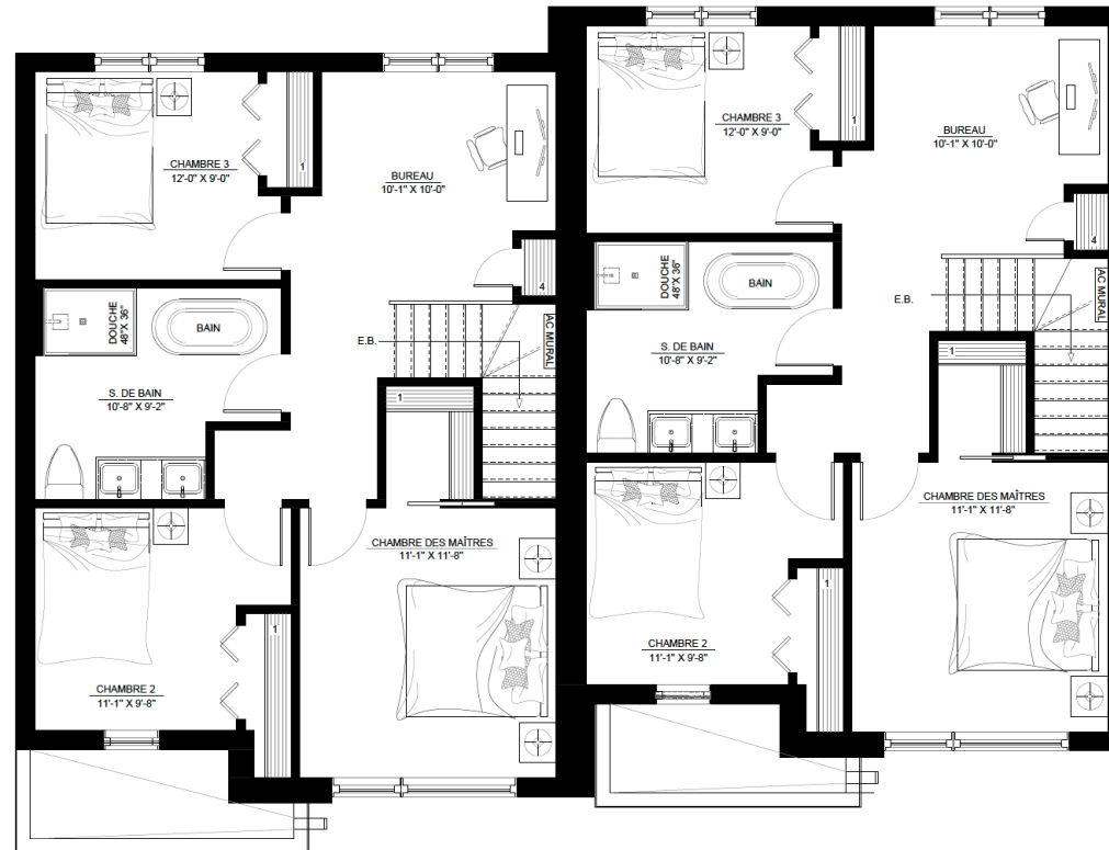
Second Floor standard

constructionexo.com info@constructionexo.com 819.410.2324