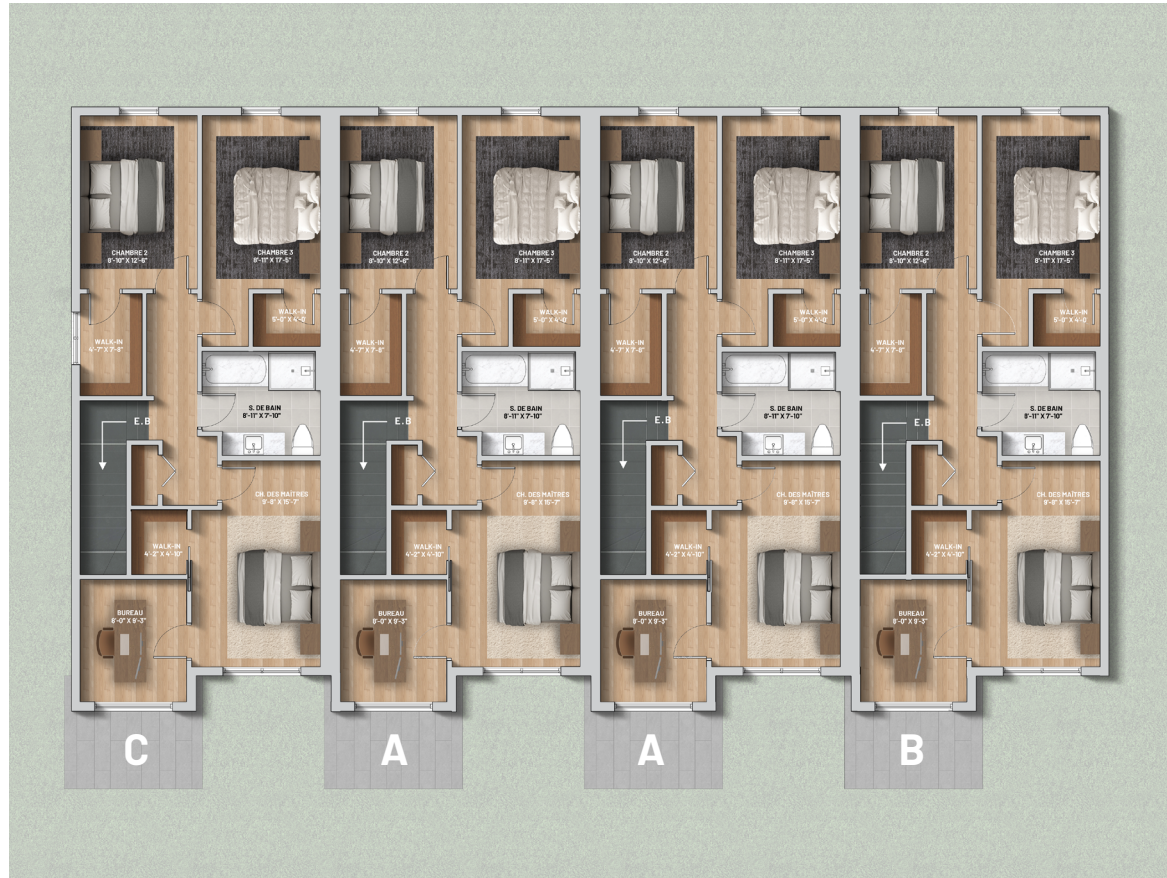
Second Floor standard

The plans and locations of windows / doors are subject to change without notice. The actual floor plan space may vary from the stated floor area Appliances are not included.